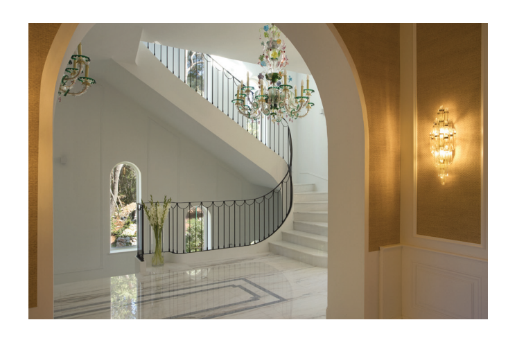
Villa Sea Princess Nika A contemporary masterpiece tucked among the Aleppo pines of Čikat Bay, our newly built jewel is fashioned in a classical style, enchanting with its historical charm and refined elegance.

Villa guests benefit from exclusive and unlimited access to Alhambra's amenities, and 24-hour private chef and International Butler Academy butler services are available upon request. A sanctuary of serenity and sophistication, the villas are ideal for groups of friends or families seeking a sense of peace, calm, and tranquility. All villas are gated with 24-hour security video surveillance.